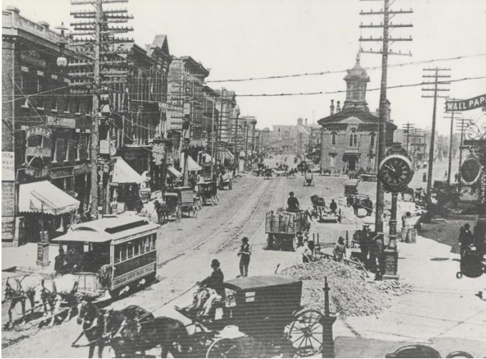
Figure 1 Market Hall - before 1895