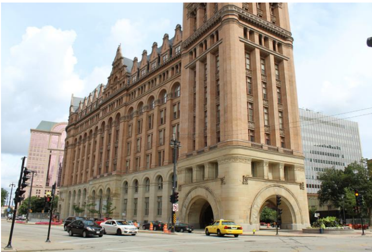
Figure 2 Milwaukee City Hall after 1990