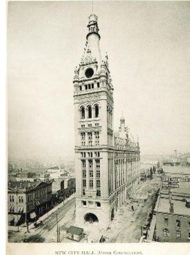
New City Hall 1895-96